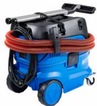
Combined hose and cable hook for easy and quick storage and flexible strap for fixation of power cord, hose and accessories and tools.